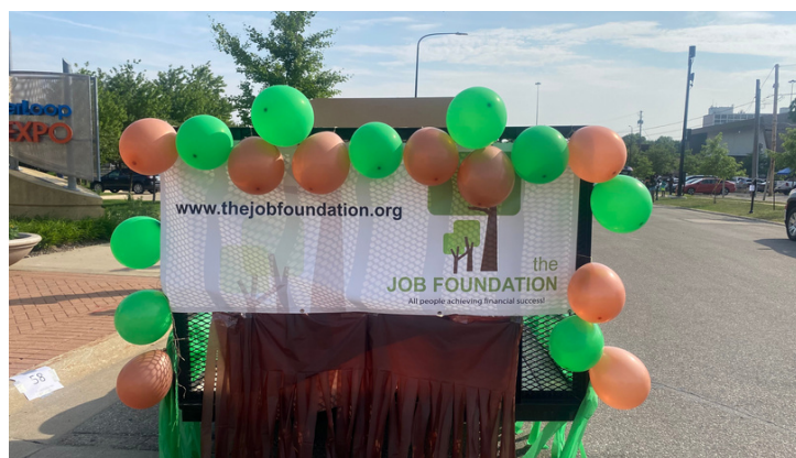
The Job Foundation's Parade Float